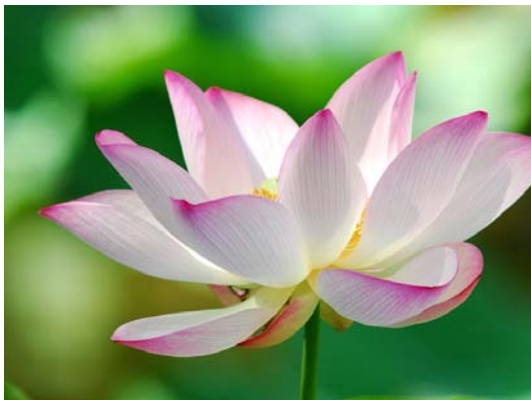
A Quiet Moment Guru as a Visionary