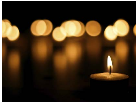
Drop of Nectar A Disciple's devotion